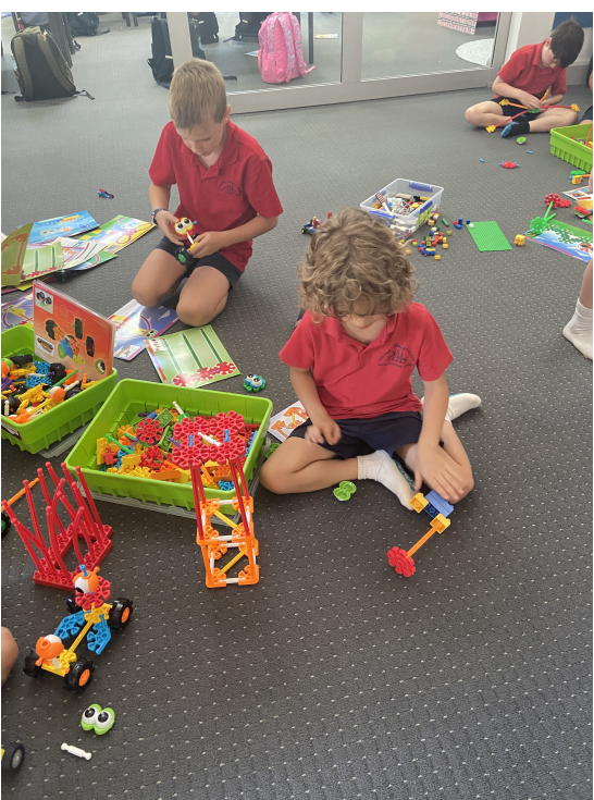
Have a great long weekend,