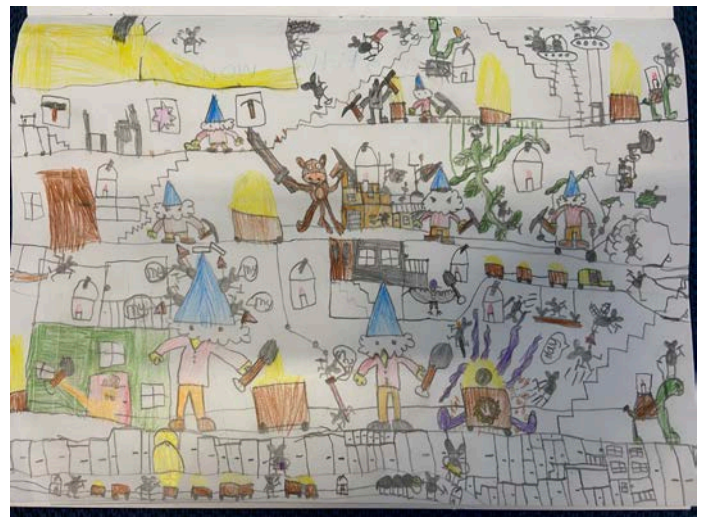
Zac Webb's illustration of Snow White and the Seven Dwarfs.